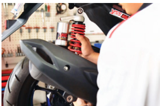
9. INSTALL THE SHOCK ABSORBER