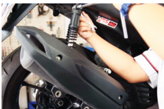
7. REMOVE THE UPPER BOLTS BY USING THE SOCKET NO.14 AND WRENCH NO.12