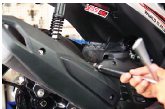
5. REMOVE THE EXHAUST BY USING THE SOCKET NO.14