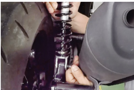
8. REMOVE THE SHOCK ABSORBER